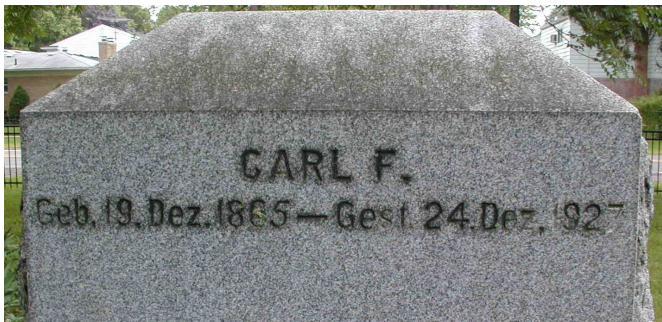
Zoellner Carl 1sch9