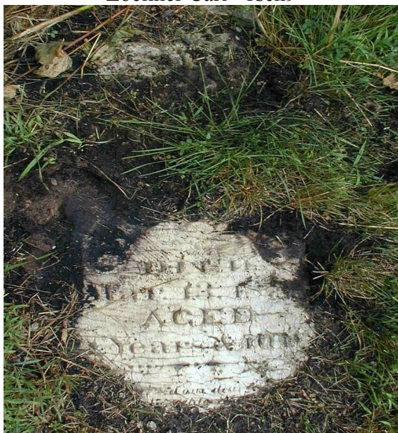
To be identified