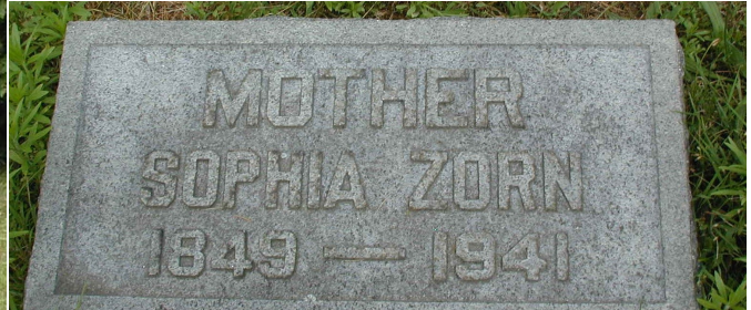
Zorn Sophia 1zor4