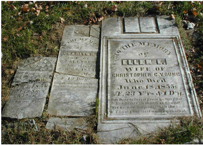
At least five stones here