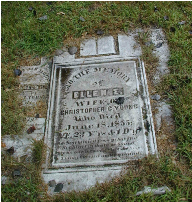
Showing stones at right side