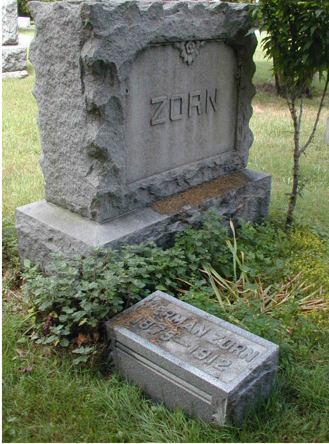
Zorn Wilhelmine Wm 2mei12