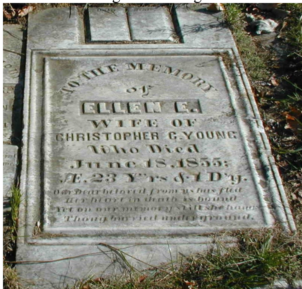
Young Ellen E d age 23 in 1855

There are hundreds of unmarked graves of stillborn day old babies and young children in this and other early cemeteries. In many there are more child graves than adult graves. The sister cemetery with good records shows between 1 ½ and two times as many children buried as adults before 1917. Many children suffered terrible deaths by miserable diseases such as Diphtheria, Whooping Cough, Cholera, Scarlet Fever, Influenza, Typhoid Fever, Inflammation of Bowels, etc. Many children did not survive to age of 21. There were no cures or medicines for these diseases then. The so called doctors had little good medical knowledge. A memorial was anonymously donated without cost to the city to honor these children and our many pioneers who also have unmarked graves. A historian was quoted "hundreds of children and adults." This was stolen by grave robbers.